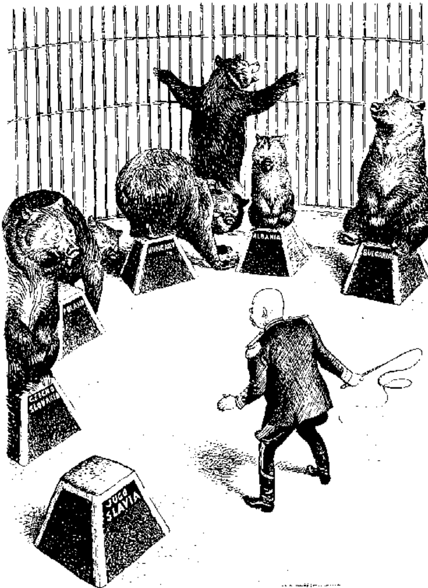
A British cartoon published in October 1956. The man in the centre is Khrushchev.