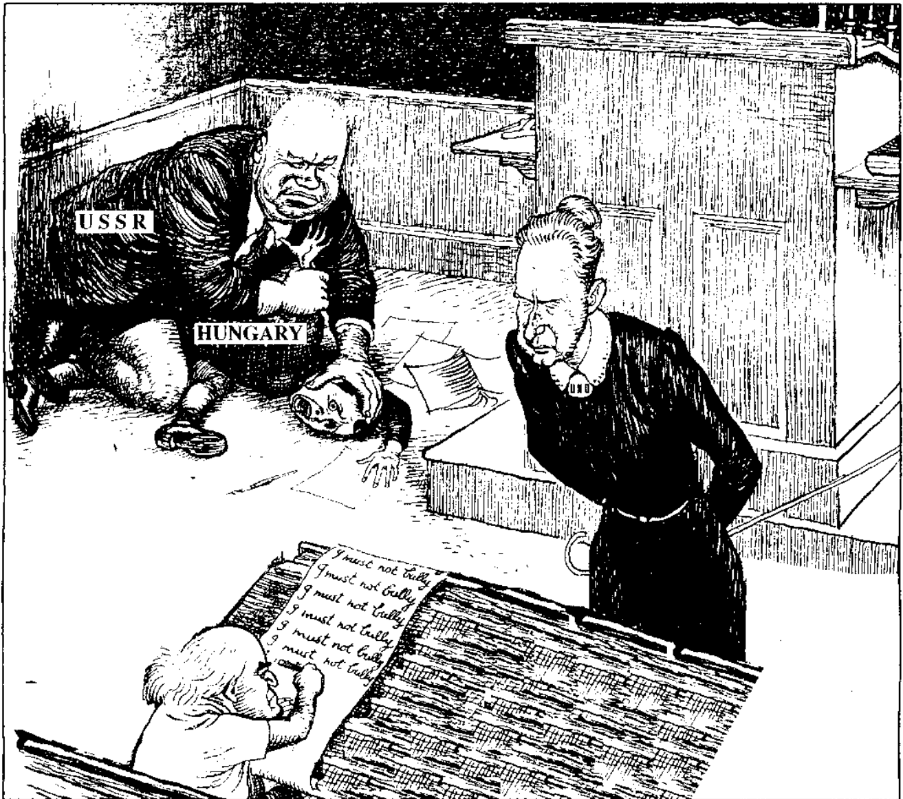
A cartoon from a British magazine, November 1956. The teacher, representing the United Nations, is punishing Israel, a small nation, for invading Egypt.